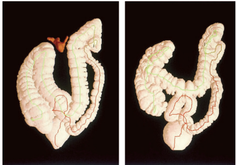
Figure 1. Three-dimensional reconstruction of colon using v3D software.

Image processing was achieved using VIATRONIX v3D COLON (version 1.2) software. This program generates a scout image (Figure 1) and a highly realistic virtual reality 3D colour view of the colonic lumen in approximately 10 min, and calculates an automated ‘fly-through’ centreline from rectum to caecum and back. The primary 3D virtual reality colonic ‘fly-through’ is co-registered with the conventional 2D CTC image, which is instantly accessible from the same screen (Figure 2). When necessary, tagged faeces and liquid were electronically cleansed from both the 3D and 2D images (Figure 3). An experienced gastrointestinal radiologist (J.B.) used the virtual reality 3D image as the primary diagnostic interface and the 2D image was used for